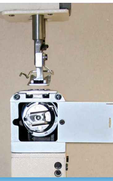
Machine is equipped with extra large diameter of hook.